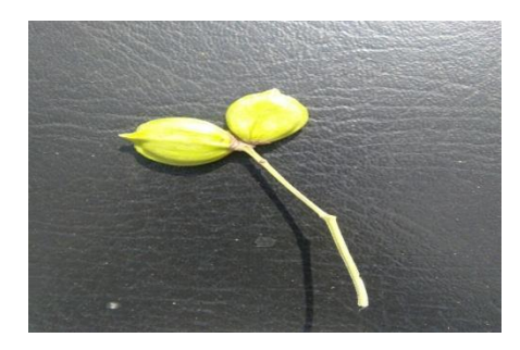
Fig.5 Plant having young bark of Nyctanthes arbortristis

Fig.4 Morphology of Nyctanthes arbortristis fruit