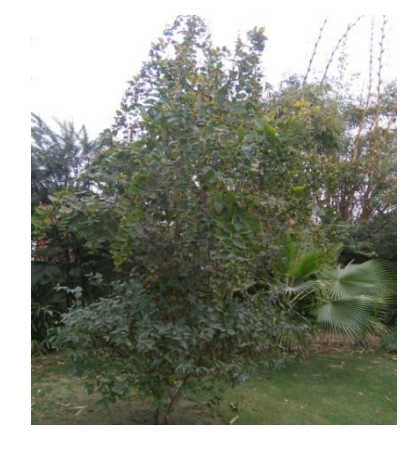
Fig.2 NAT leaves showing morphology